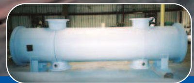
Alloy 625 Clad HE Shell