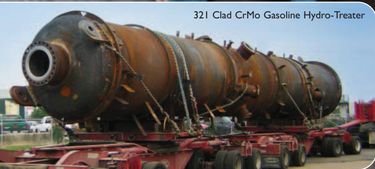
321 Clad CrMo Gasoline Hydro-Treater