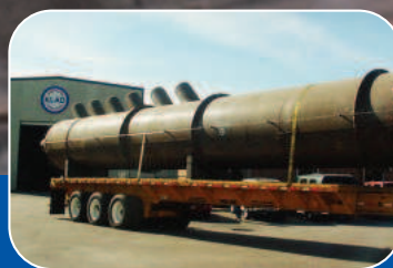
317L Clad Transfer Line Header