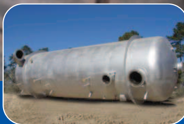
304L Clad FCC Flare Knockout Drum