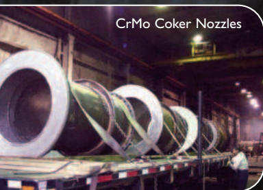
CrMo Coker Nozzles